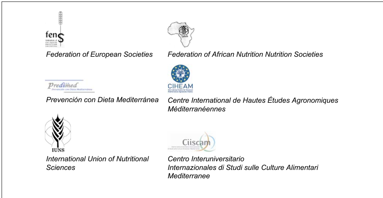
Fig. 3 (Continued)

although needs may vary among people due to age, physical activity, personal circumstances and weather conditions. It should be consumed freely, bottled or from the tap, when hygienic circumstances allow it. In addition to water, sugar-free herbal infusions and tea, and low-sodium and low-fat broths may help to complete the requirements.